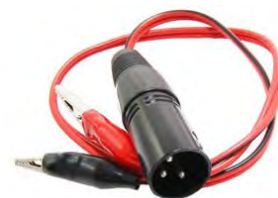
Alligator Clip Cable