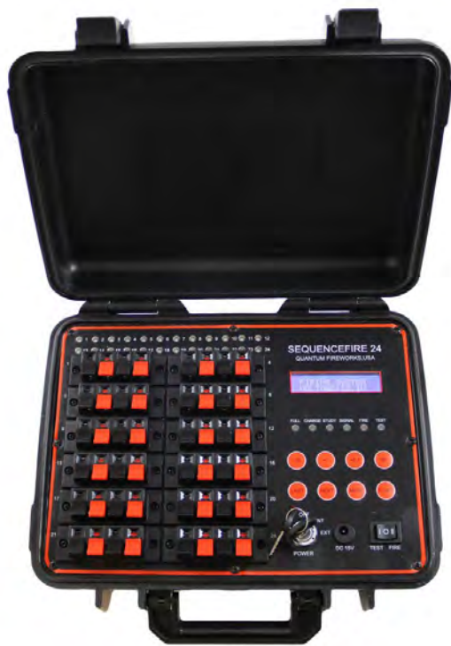
Sequencefire 24 Field Module (Receiver)