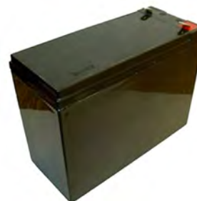
External Battery (optional)